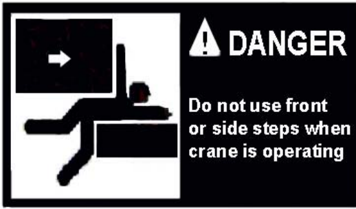
Warning Label Part No. 300795