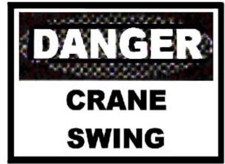
Warning Label Part No. 101049